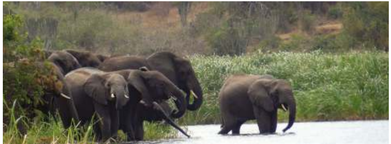
The stunning wildlife and the breathtaking crater lakes

The lodge offers a range of activities and attractions: take safari drives to discover a vast array of wild animals; experience water safaris on the Kazinga Channel using one of our luxury boats; or watch some of the 619 different species of birds found in our park. Nearby, chimpanzees can be found in the breathtaking Kyambura Gorge. Here the ancient movement of tectonic plates has created a natural forest habitat for hippos, monkeys, chimpanzees, elephants and buffalos.