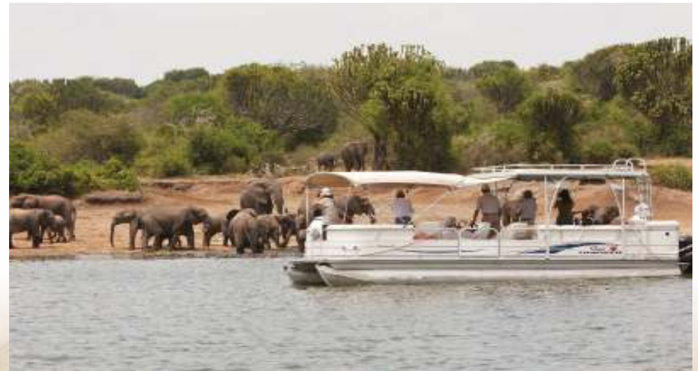
The unique water safaris at Mweya Safari Lodge

Bush breakfast + Game drive + Kazinga Channel water safari + Chimp tracking + Nature walk + Tree climbing lions trip + Lion tracking and monitoring + Mongoose research + Katwe cultural tour + Bird watching + Cultural community attractions + Crater Lakes trip.